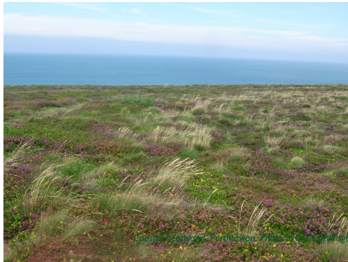
Coastal heathland, Porthiowan.