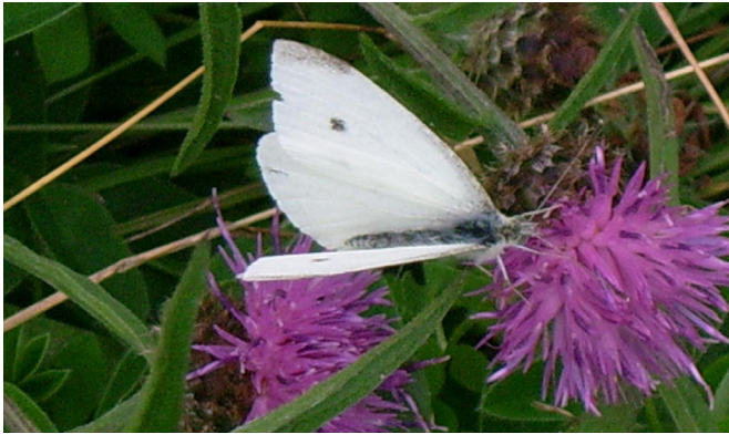
Large white butterfly.

County Wildlife Sites are an important part of the countryside and make up approximately 10% of our county's land area. They often underpin local, national and regional nature conservation objectives (Biodiversity Action Plans).