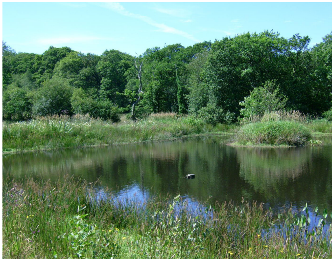
Good dragonfly habitat, North Tamerton.

They were selected because of their high nature conservation value. Selection was based on distinctive, important or threatened species and habitats in either a national, regional or local context. Selection also aimed to link and buffer other important areas for nature conservation, such as SSSIs.