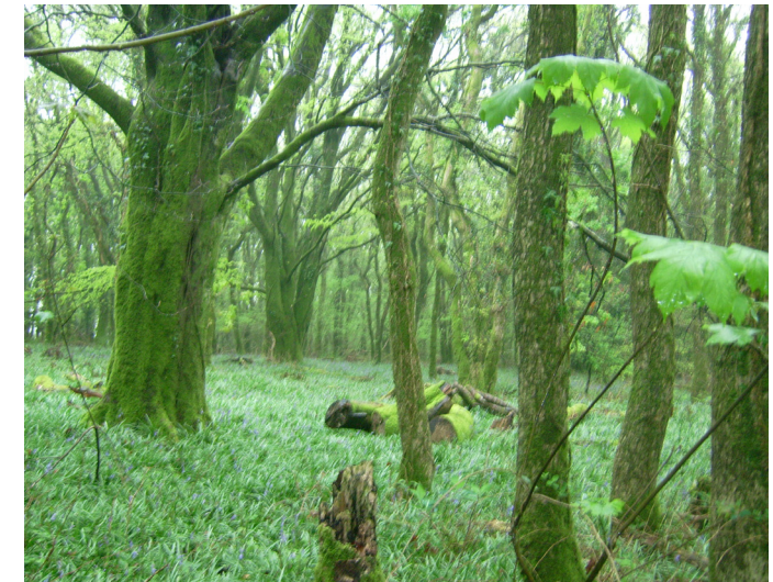
Broadleaved bluebell woodland near Liskeard.