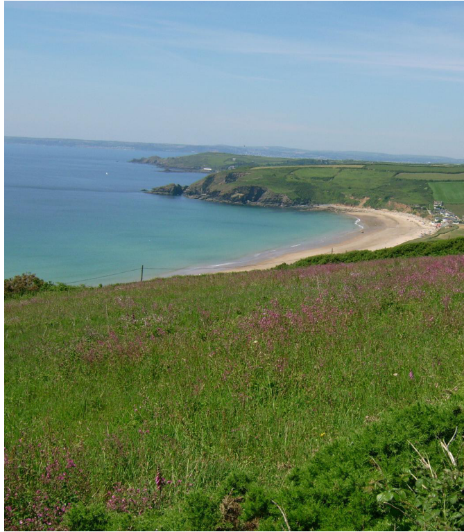
Meadow by the sea, Mount's Bay.